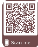
For Permit / Inspection Status

The 2nd Portal is the Contractor's Portal . You will notice a QR code on the permit, which when scanned takes you directly to the portal. We suggest that field personnel install a QR reader or bookmark the site in their mobile device.